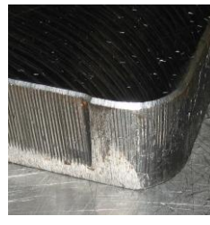
flame cut or laser-cut parts