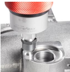
uniformly deburred edges